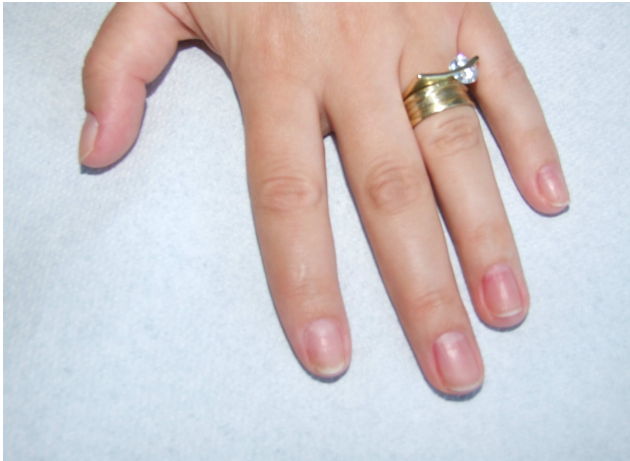
Fig. 15. Fourth case - left fingernails - after treatment.