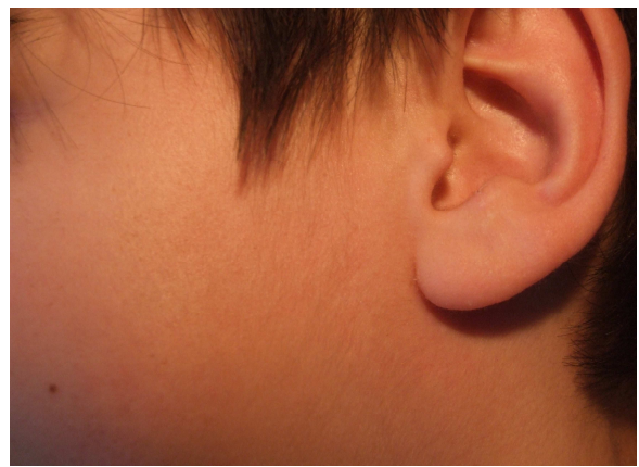
Fig. 4. First case - preauricular area - after treatment (b)