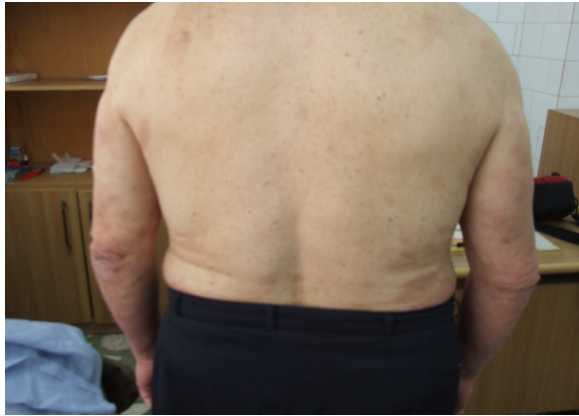
Fig. 7. Second Case - at 2 years post-treatment.