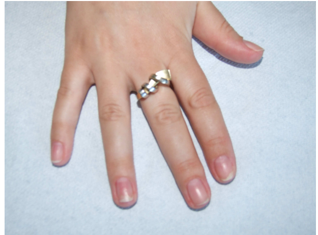
Fig. 16. Fourth case - right fingernails - after treatment