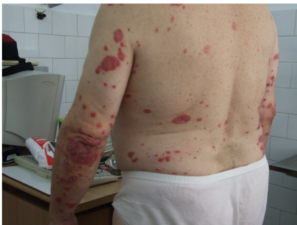
Fig. 5. Second Case - A 66-year old male - before treatment (a).