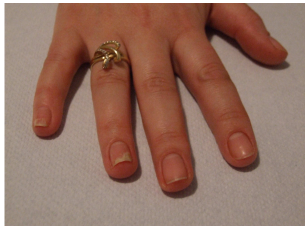
Fig. 14. Fourth case - right finger nails - before treatment.