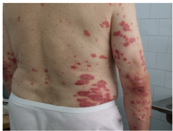
Fig. 6. Second Case - A 66-year old male - before treatment (b).