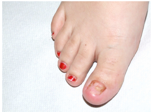
Fig. 18. Fourth case - toe nail - before treatment.