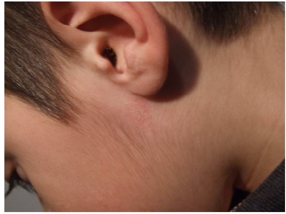
Fig. 2. First case - before treatment (b).