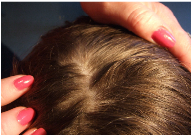
Fig. 3. First case - scalp - after treatment (a)