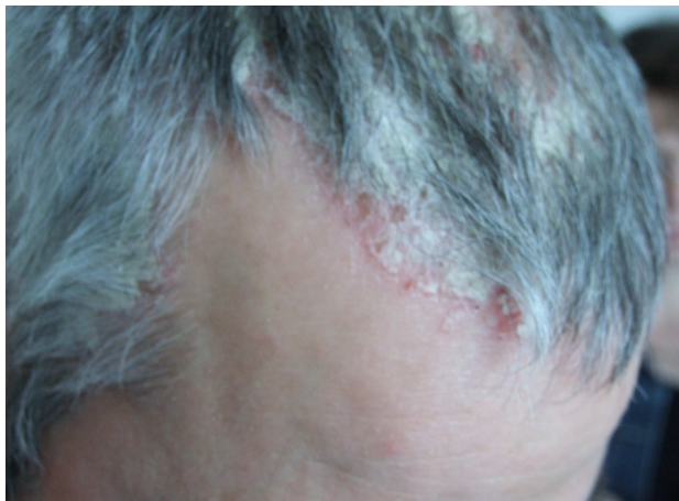
Fig. 9. Third case - scalp area - before treatment.