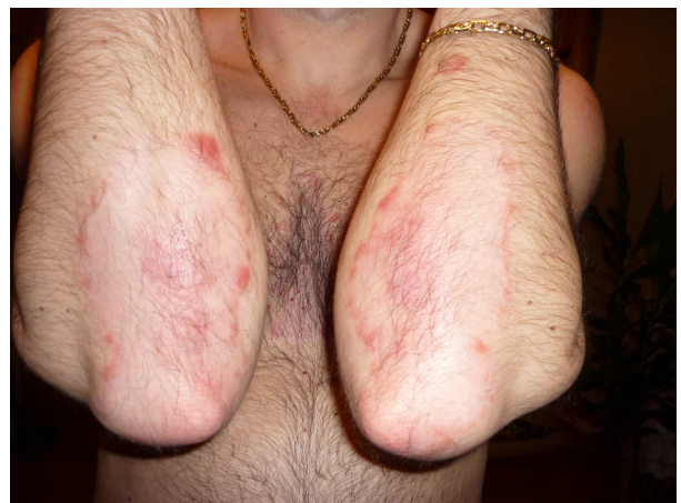
Fig. 12. Third case-elbow area- after treatment.