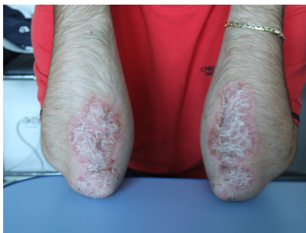
Fig. 11. Third case-elbow area- before treatment.