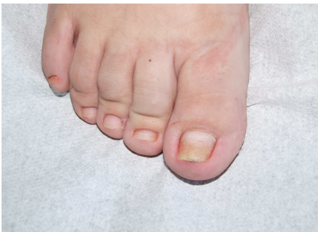
Fig. 17. Fourth case - toe nail - after treatment.