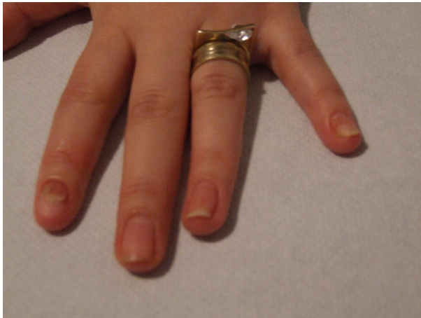
Fig. 13. Fourth case - left finger nails - before treatment.