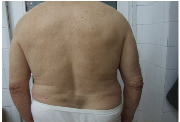
Fig. 8. Second Case - at 5 months post-treatment.