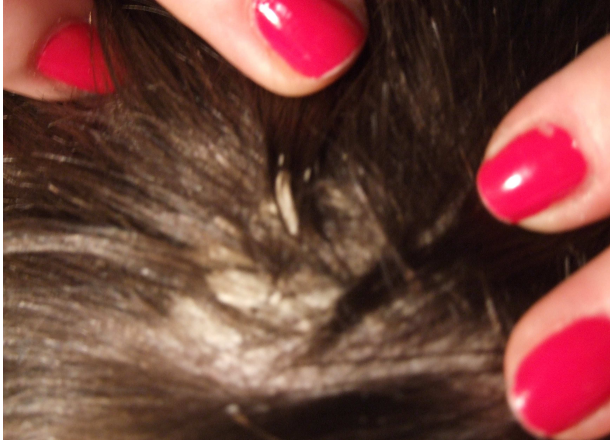
Fig. 1. First case - scalp - before treatment (a).

therapies such as vitamin D analogues, topical calcineurin inhibitors, topical steroids, anthralin and topical retinoids 5 have all been utilised, with varying results.